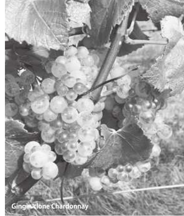
Gingen Clone Chardonnay