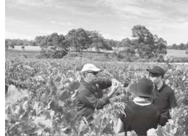
From the Village Cellars visit in March 2023 photograph by T.Adachi (Sale, Village Cellars)